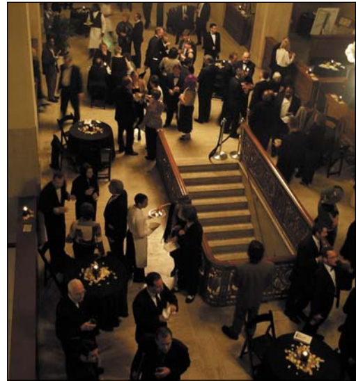
Guests mingle at Stop the Wrecking Ball

Preserving Trenton's threatened heritage assets continued to be a top priority of the Trenton Historical Society. Work started in 2002 came to fruition in 2003, while new efforts were begun. The Trenton Top 10 Endangered Buildings List was released and publicized as part of National Preservation Week in May 2003. Two events, "In and Around Adeline: A Walking Tour of a South Trenton Neighborhood" in March, and "Stop the Wrecking Ball" in November, educated and raised funds for preservation projects. Also in November, the THS learned that a $15,000 grant from the New Jersey Historical Commission was secured to be used to write a National Register of Historic Places Nomination for the Trenton Ferry District in South Trenton.